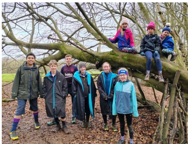
Some of our EMJOS participants at Allestree Park.